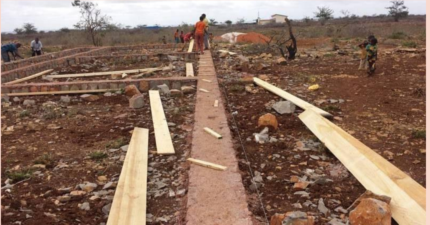
FOUNDATION WORK OF FIDALE 1 SCHOOL IN BAIDOA, BY GAABOW CONSTRUCTION COMPANY, FUNDED BY NRC 2015