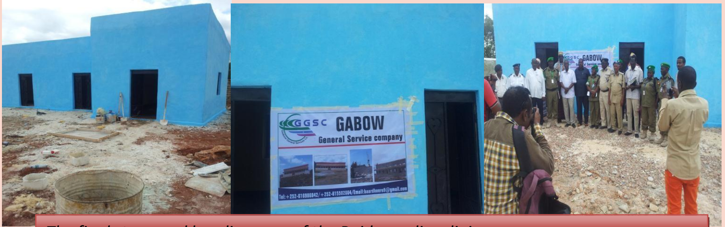
The final stage and handing over of the Baidoa police clinic