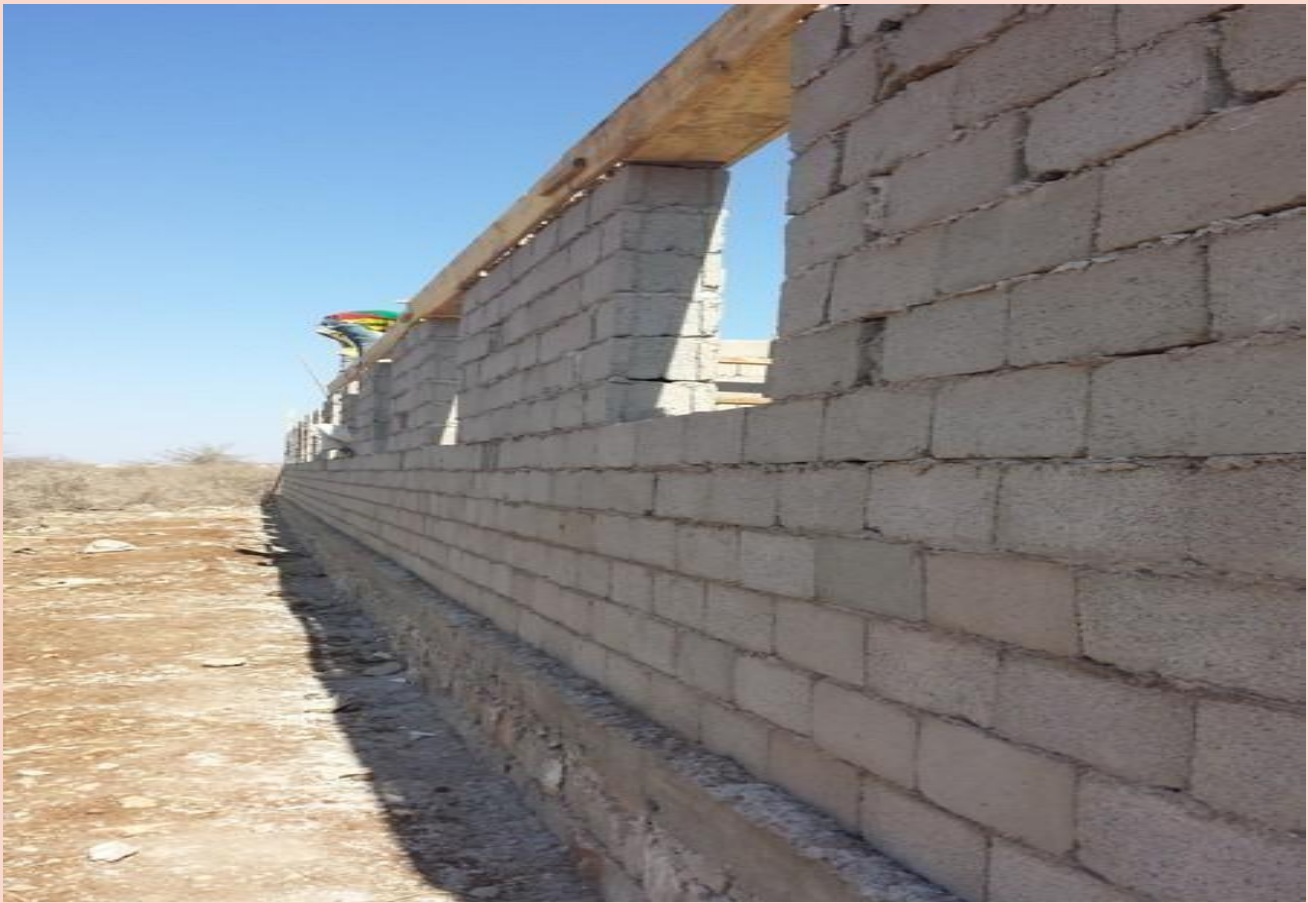
FRONTWORK OF DALE 1 SCHOOL IN BAIDOA, BY GAABOW CONSTRUCTION COMPANY, FUNDED BY NRC 2015