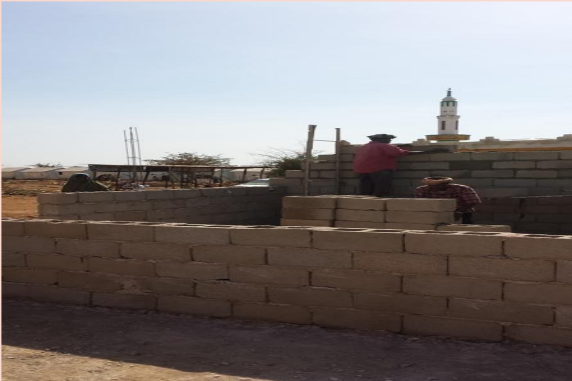
WALLING WORK OF FIDALE 1 SCHOOL IN BAIDOA, BY GAABOW CONSTRUCTION COMPANY, FUNDED BY NRC 2015