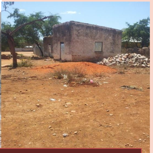
This is the police clinic in Baidoa before the rehabilitation