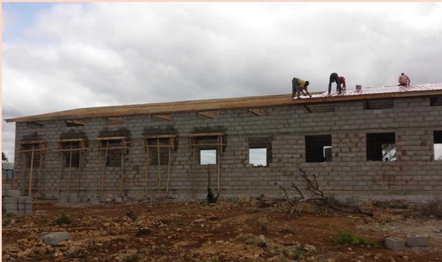
ROOFING OF IDALE 1 SCHOOL IN BAIDOA, BY GAABOW CONSTRUCTION COMPANY, FUNDED BY NRC 2015